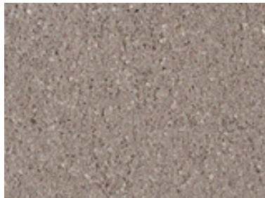
stony cool sandstone