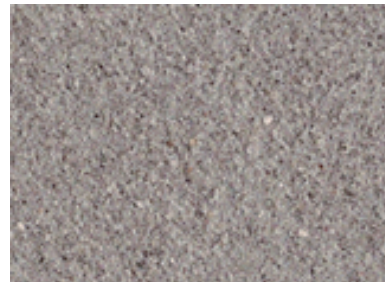
stony concrete grey