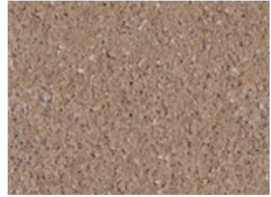
stony warm sandstone