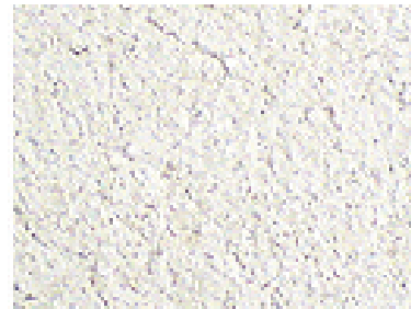
stony dolomite white